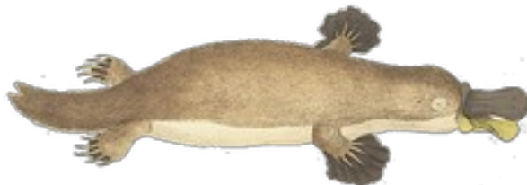
Platypus: Frederick Polydore Nodder, CC0, via Wikimedia Commons