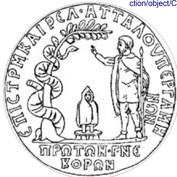
Ramsay p. 258

https://www.britishmuseum.org/collection/object/C_2002-0101-1449