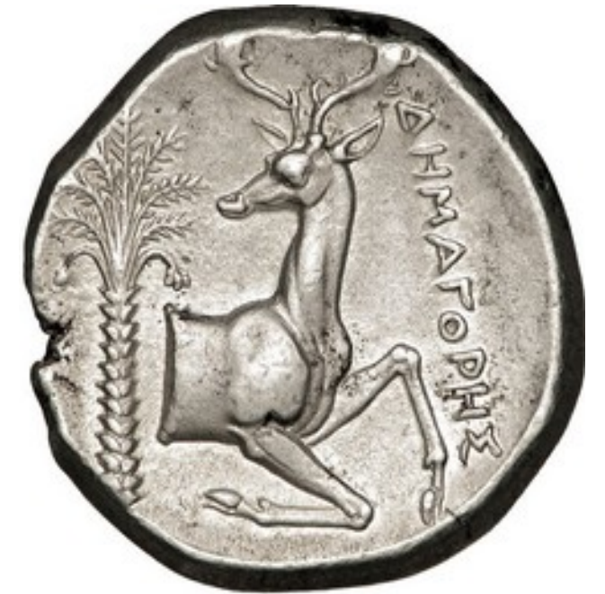
Top: British Museum, 2003.0402.4, ca 200 BC Bottom: 370-389 AD