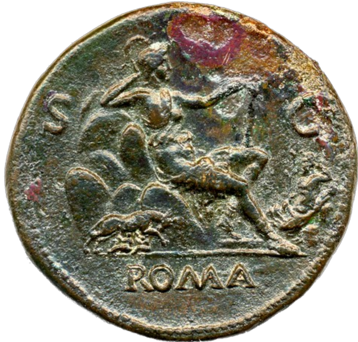
Coin of Vespasian (ca. AD 70) showing goddess Roma sitting on seven hills.

Dan 7:17 These great beasts, which are four, are four kings, which shall arise out of the earth.