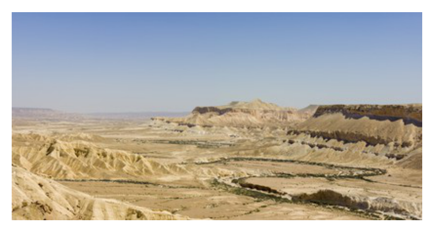
Figure 3: Trees growing by the water.

5 Therefore the ungodly shall not stand in the judgment, nor sinners in the congregation of the righteous [pl]. 6 For the