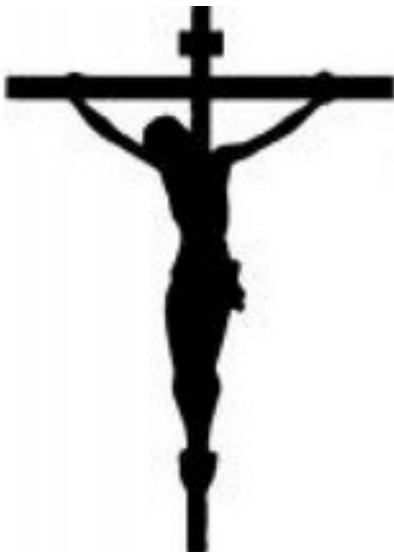
The Lord Jesus

22 For as in Adam all die, even so in Christ shall all be made alive.