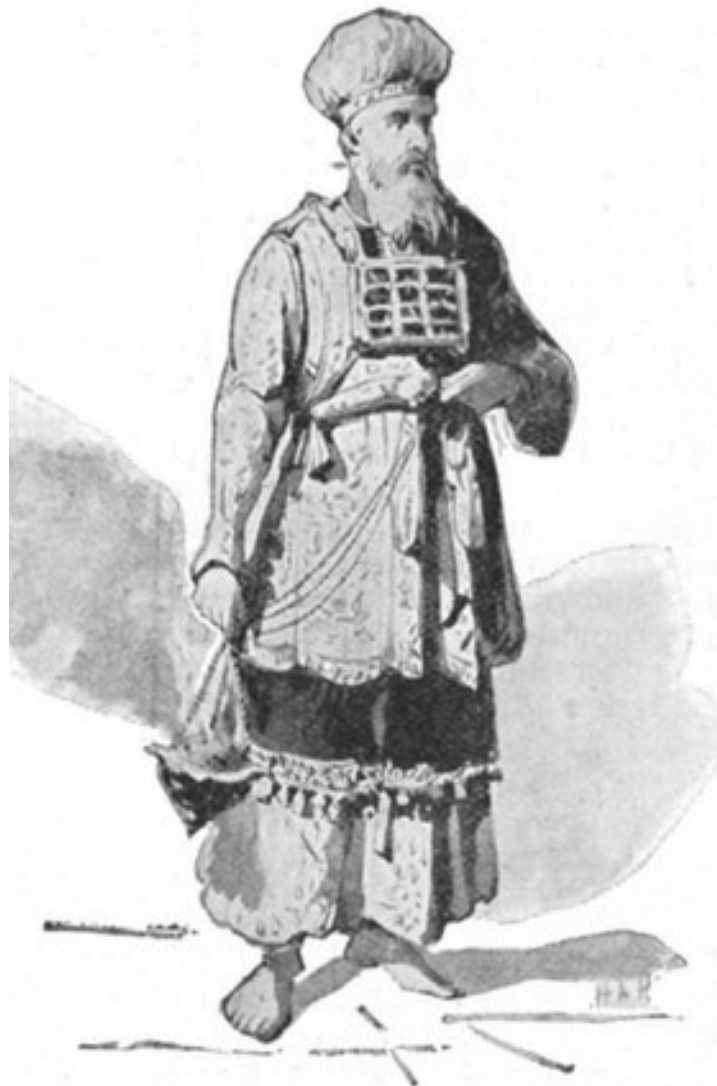
HIGH PRIEST IN ROBES AND BREASTPLATE. —Lev. viii. 8.

https://upload.wikimedia.org/wikipedia/commons/c/c6/LEV_8-High_priest_in_rob_and_breastplate.jpg