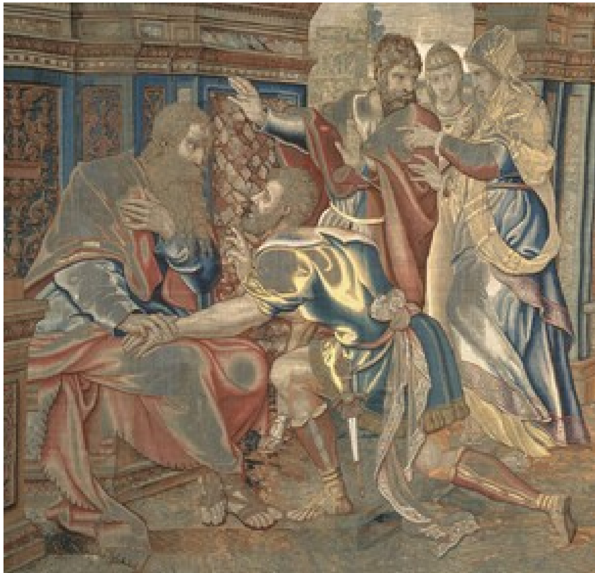
https://www.rct.uk/collection/search#/16/collection/1046/the-story-of-abraham-series 16 th century tapestry at Hampton Court, UK

Gen 24:2 And Abraham said unto his eldest servant of his house, that ruled over all that he had, Put, I pray thee, thy hand under my thigh: 3 And I will make thee swear by the LORD , the God of heaven, and the God of the earth, that thou shalt not take a wife unto my son of the daughters of the Canaanites, among whom I dwell: 4 But thou shalt go unto my country, and to my kindred, and take a wife unto my son Isaac. ... 8 And if the woman will not be willing to follow thee, then thou shalt be clear from this my oath : only bring not my son thither again.