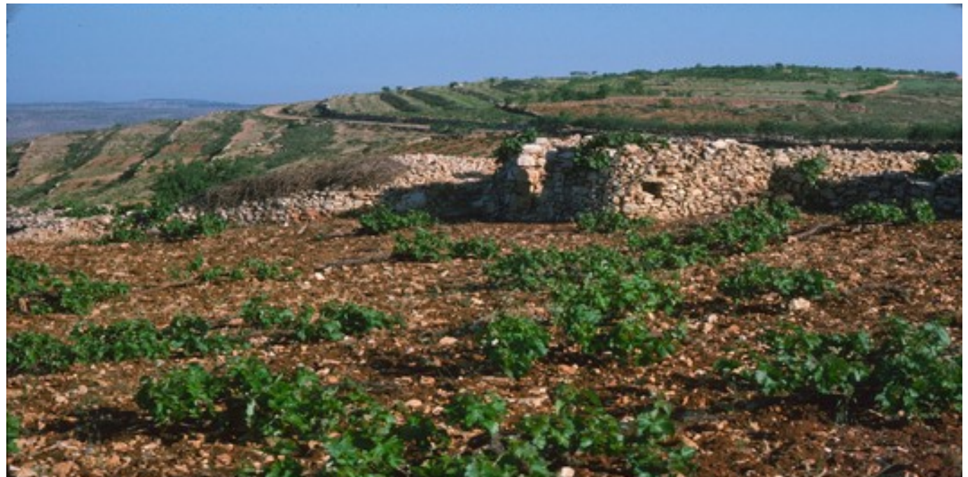
June 1975

Judg. 14:5 Then went Samson down, and his father and his mother, to Timnath, and came to the vineyards of Timnath: and, behold, a young lion roared against him.