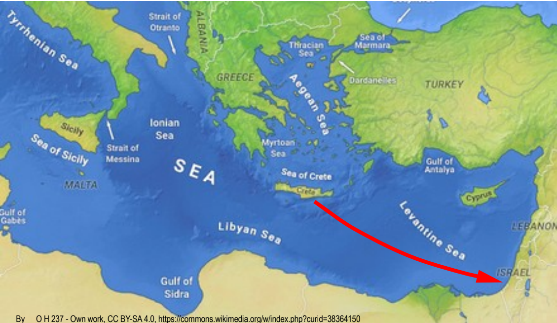
By O H 237 - Own work, CC BY-SA 4.0, https://commons.wikimedia.org/w/index.php?curid=38364150