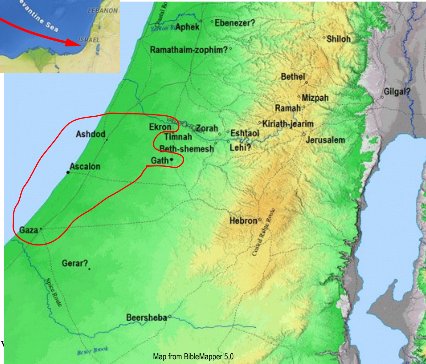
Map from BibleMapper 5.0

Gen 10:6 And the sons of Ham; Cush, and Mizraim, ... 13 And Mizraim begat Ludim, and Anamim, and Lehabim, and Naphtuhim, 14 And Pathrusim, and Casluhim, (out of whom came Philistim ,) and Caphtorim.